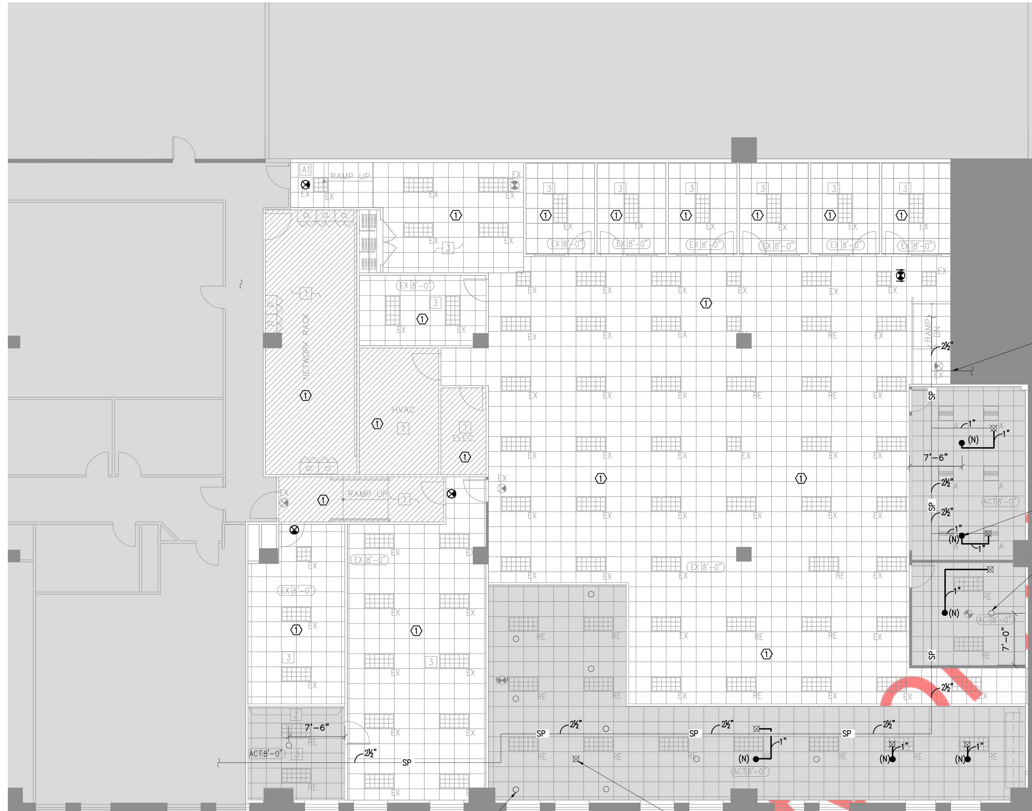
1 PARTIAL 3RD FLOOR SPRINKLER PLAN SCALE: 1/8" = 1'-0"