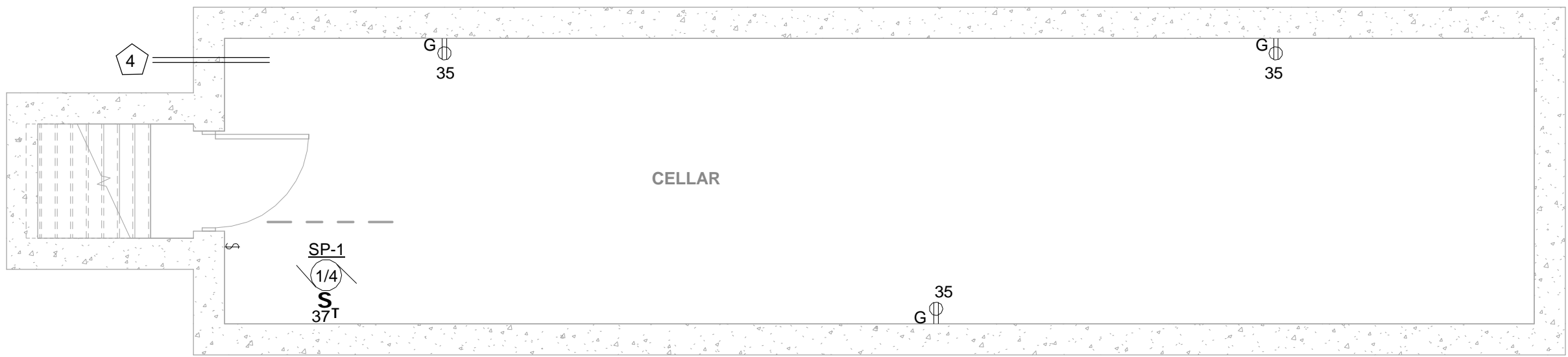
2 CELLAR ELECTRICAL POWER PLAN 1/4" = 1'-0"