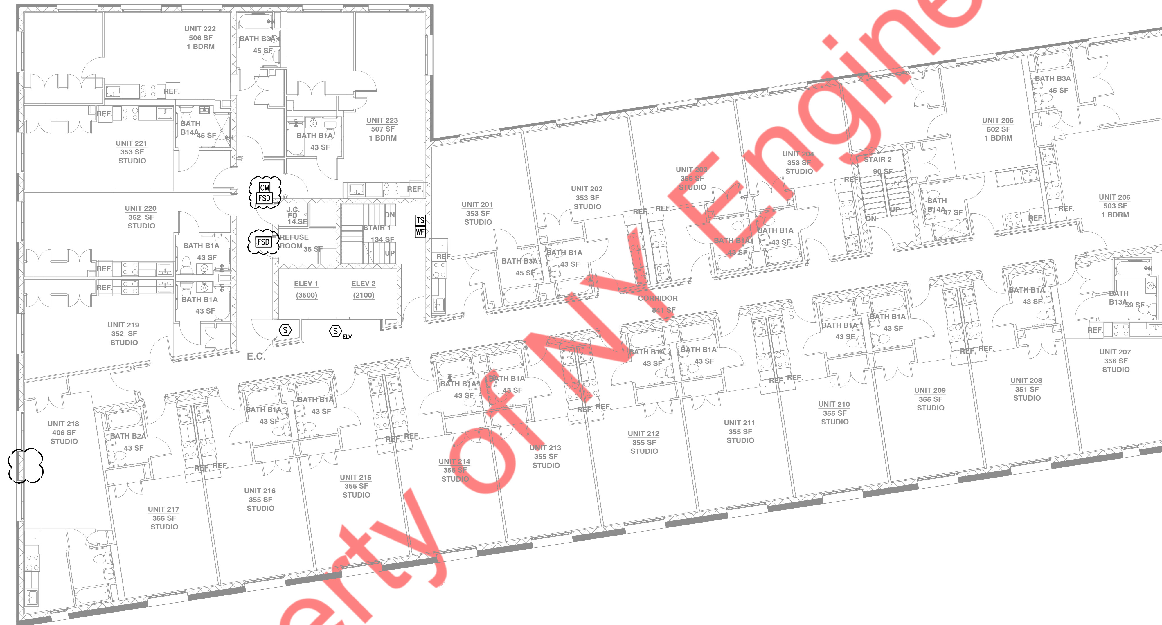
1 2ND FLOOR FIRE ALARM PLAN SCALE: 1/8" = 1'-0"