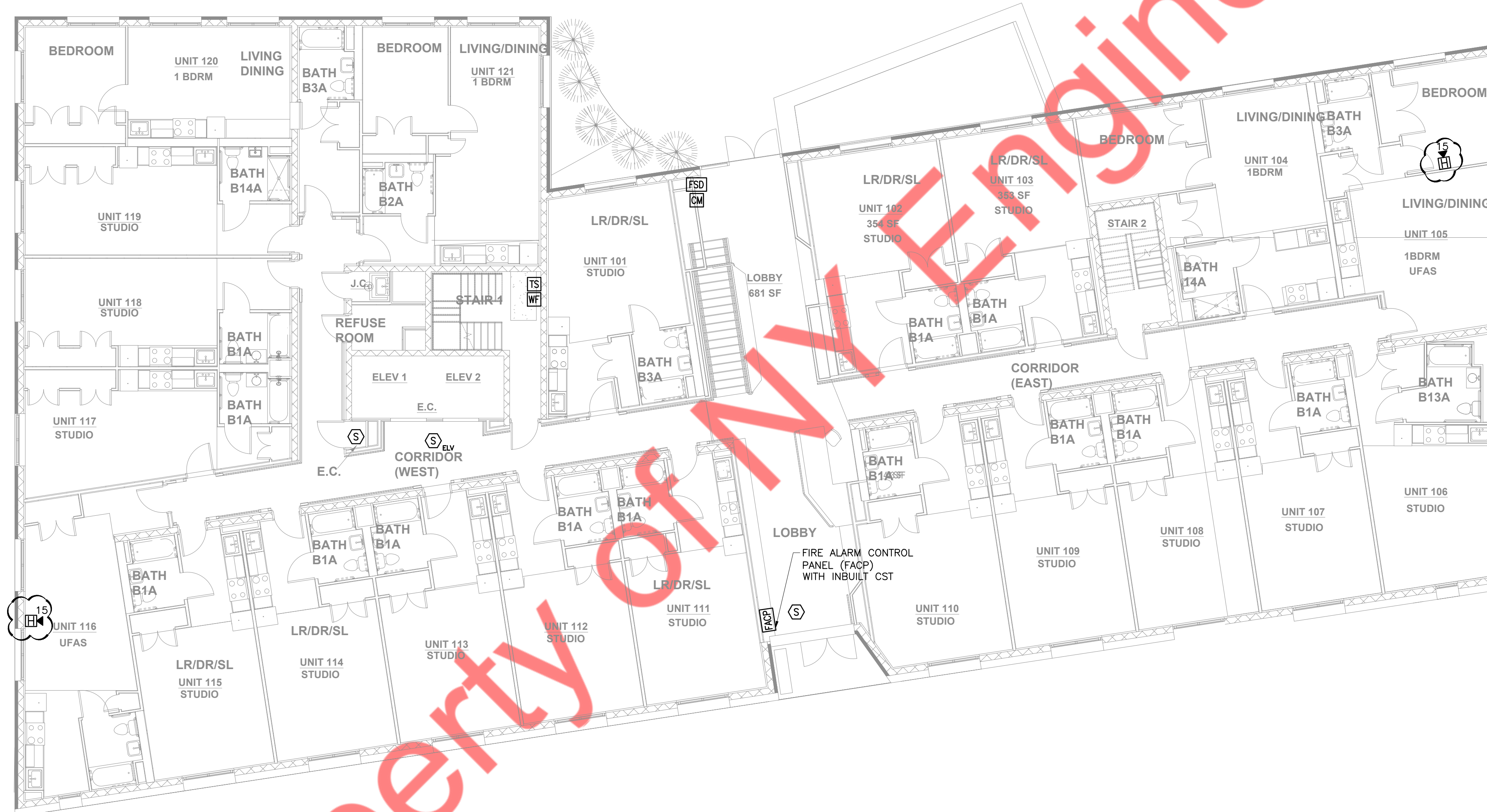
1 GROUND FLOOR FIRE ALARM PLAN SCALE: 1/8" = 1'-0"